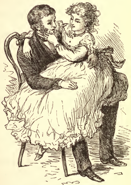
“She perched herself on his knee.”

whiskers so saucily, and then, springing up, began arraying herself in such an astonishing daintiness of device, and fluttering before him with such a variety of well-assorted plumage, that John was quite taken off his feet.